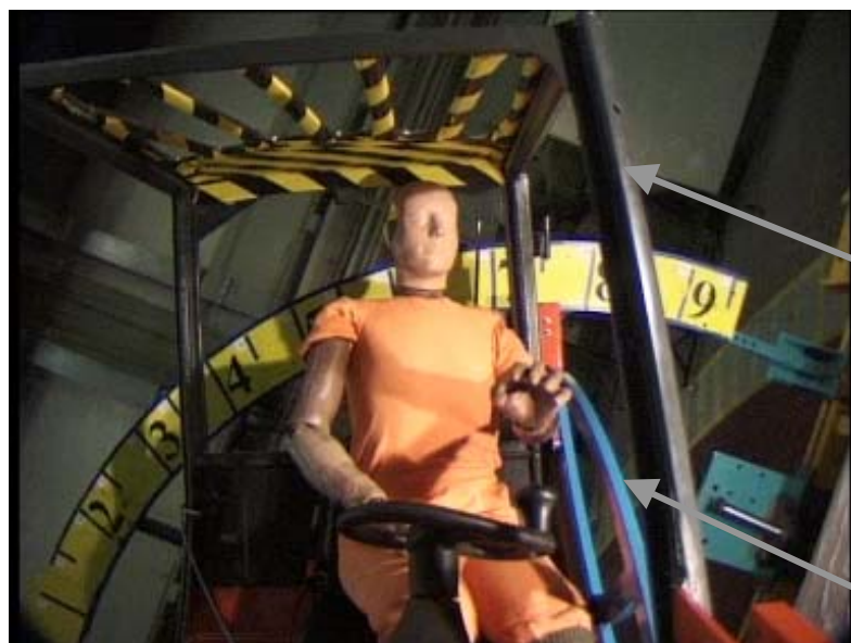
Fig. 7: dynamic tipping tst with a moving camera