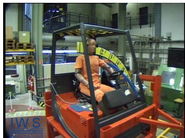
Fig. 4: used dummy

The speed of the test platform moving on a circular path was increased from outside up to the attainment of the point of tipping. In principle, this is equivalent to a drive with a forklift truck that increases its speed in a turn with a constant radius up to the tipping limiting speed.