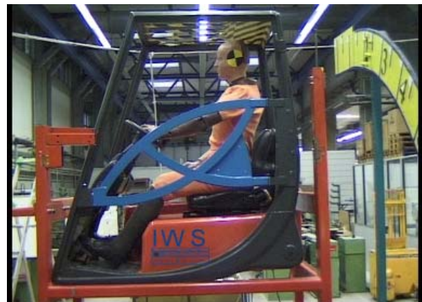
Fig. 3: tested door handle

The assembling height of the door handle was chosen corresponding to the VDI Directive 2198 accordingly seating height h_7 . Corresponding to DIN 33402 Part II, we assumed a thigh height of 165 mm (95th percentile, male, age 26 to 40). Accordingly, the centre line of the lower door handle's carrier shall pass in a height of approx. 80 to 90 mm above the seating height of the operator's test cab (original operator's cab of front-seat forklift truck of Linde AG, type E16).