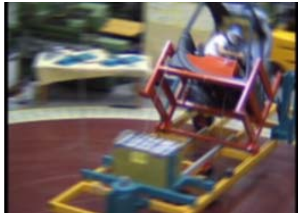
Fig. 1: Test bench for static and dynamic tipping tests

The restraint system tested within the scope of the research project, kept the test subject inside the operator's cab that was formed by roof support and protective roof. Afterwards, tipping tests up to a tipping angle of 90° were realized with a dummy (see fig. 2).