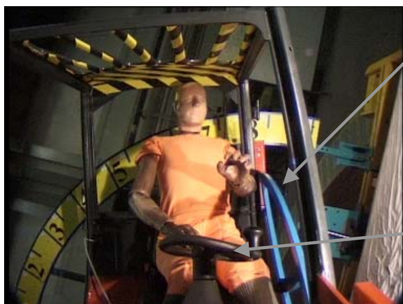
Fig. 8: dynamic tipping test at approx. 76°