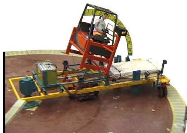
Fig. 2: Tipping test with a dummy