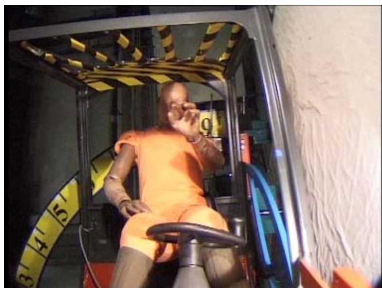
Fig. 9: dynamic tipping test – impact