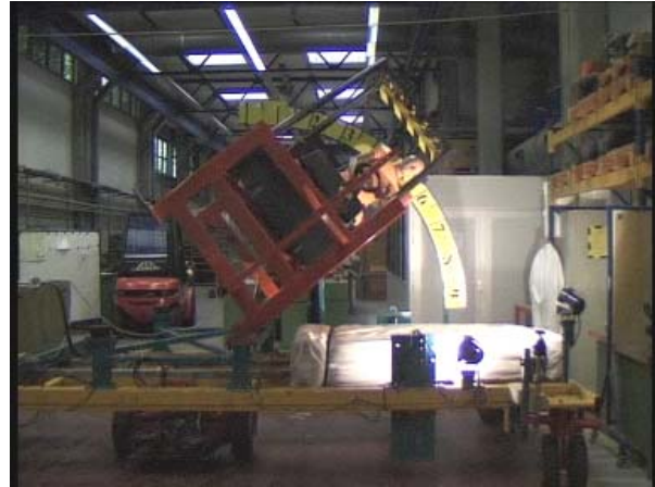
Fig. 6: dynamic tipping at an angle of about 45°

The dummy is moved towards the door handle even before the tipping is started. At a tipping angle of approx. 45° to 50° (fig. 6) the dummy loses its hold on the seat but is not strongly pressed against the door handle. We have realized this test several times under the same circumstances. The test body has never perceptibly touched the door handle during the tipping in one of these tests. This is clearly perceptible in fig. 7 which shows the dummy's position during the second phase of the tipping process exemplary for all tests. At a tipping angle of 75° the dummy still remains completely inside the shelter divided by the door handle, but without perceptibly touching it. Even immediately before the impact (fig. 9) the dummy is not touching the door handle.